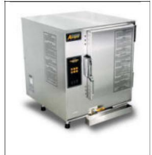
AccuTemp Products, Inc. 8415 North Clinton Park Drive Fort Wayne, IN. 46825

a Each Load is based on a minimum average of three test replicates.